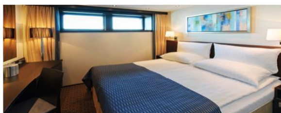
Deluxe Stateroom 172.0 sq. ft. Indigo Deck (Category D, E)

PRICING: Deluxe Stateroom from $4,809.00 Panorama Stateroom from $6,380