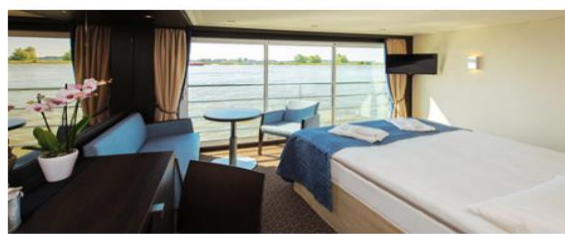
Panorama Suite 200.0 sq. ft. Sapphire, Royal Deck (Category A, B, P)