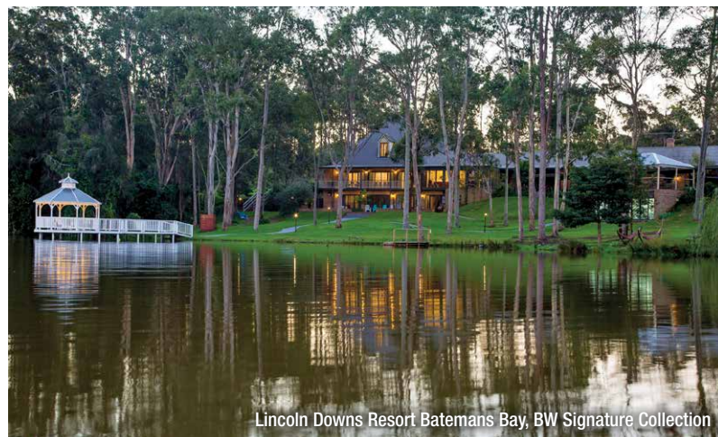
Lincoln Downs Resort Batemans Bay, BW Signature Collection