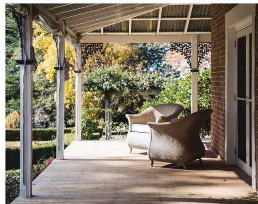
ROWLEE GUEST HOUSE, ORANGE ★★★★

Rowlee's vineyard villa is set in an established vineyard and garden on a stunning 80 acre property in the heart of the Orange Wine Region. Its the perfect secluded getaway for couples looking for a unique and indulgent experience.