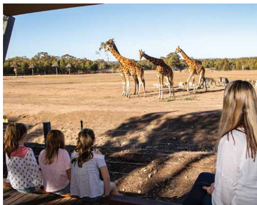
ZOOFARI LODGE, DUBBO ★★★★

Nestled behind the Zoo's African Savannah is Zoofari Lodge comprising of 15 stylish African-style lodges. Sit back and relax on your lodge deck and listen to what the animals get up to after dark.