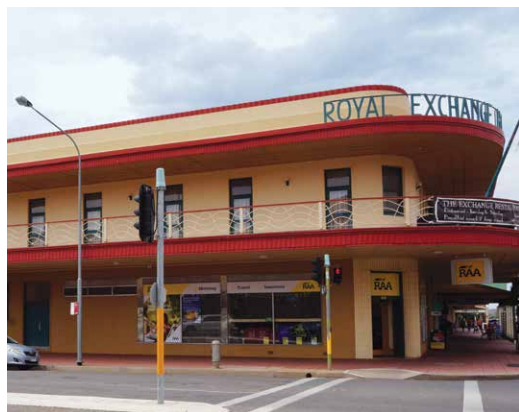
ROYAL EXCHANGE HOTEL, BROKEN HILL ★★★★★

With Indigenous heritage and culture, pastoral history, outback towns and iconic waterways, the state's country and outback regions have so much to offer. Broken Hill, one of Australia's most famous outback towns, is a living, breathing time capsule blending modern art and a sprawling desert landscape. Home to the Taronga Western Plains Zoo, Dubbo is located on the Macquarie River and is the perfect setting for a relaxed getaway.