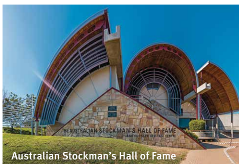
Australian Stockman's Hall of Fame