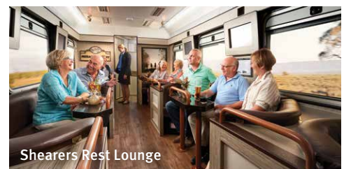
Shearers Rest Lounge

Explore the iconic Australian Stockman's Hall of Fame