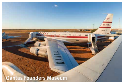
Qantas Founders Museum