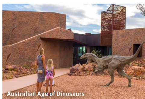
Australian Age of Dinosaurs